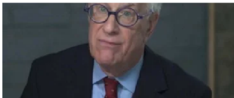
"Move your money by early 2022." Wall Street legend warns