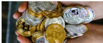
The 12 best cryptocurrencies ready to explode in 2022