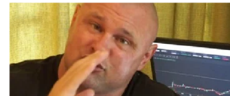
Crypto Millionaire Legally "Hacks" Blockchain Data & Makes Millions