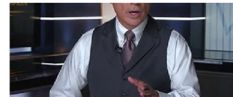
Dump Bitcoin Now - A New Coin Is in Town...